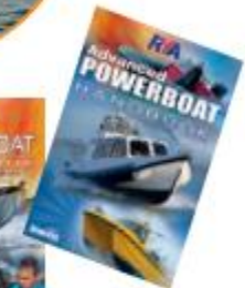
Advanced Powerboat handbook